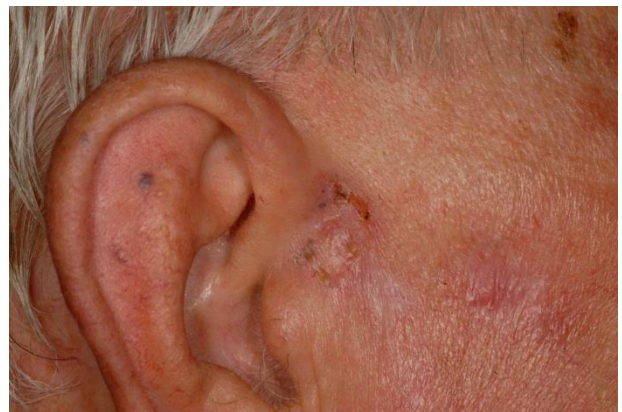
4 weeks after treatment