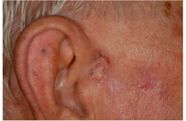
4 weeks after treatment