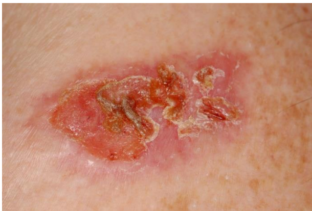
Basalioma: Before treatment