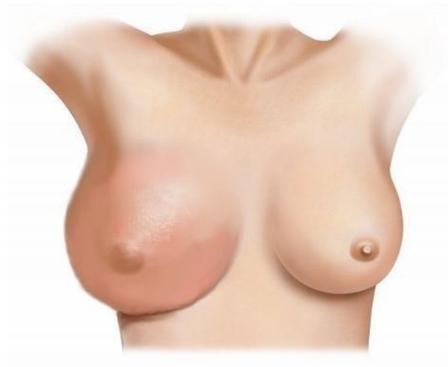
Inflammatory Breast Cancer

THE SOLUTION FOR PREVENTING AND TREATING BREAST CANCER IS THE CLINICALLY TESTED R47-PROTUMOL ® CREAM