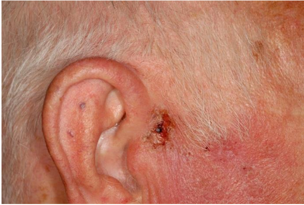
Basalioma: Before treatment

treatment cream is effective not only on the area to be treated, but in parallel with the treatment, due to the significance of the composition of the ingredients, it also promotes the process of regeneration through roborating the immune system.