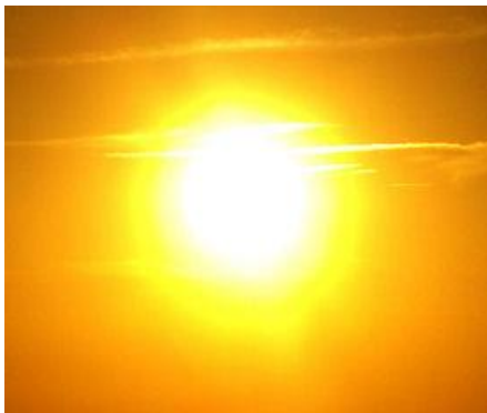
UVB radiation →