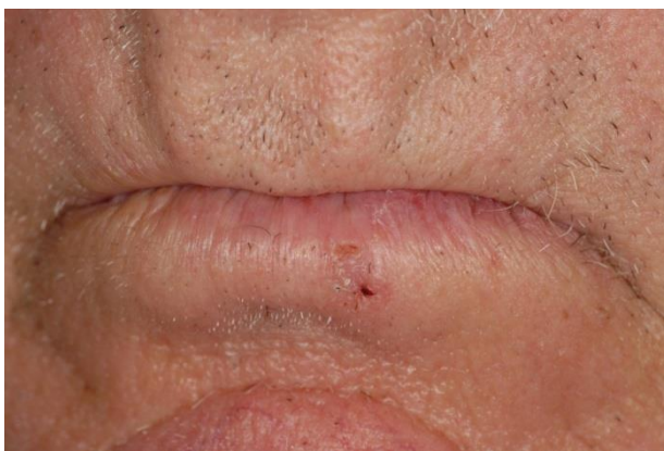
Basalioma: Before treatment