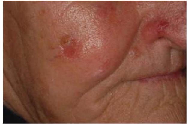
3 weeks after treatment