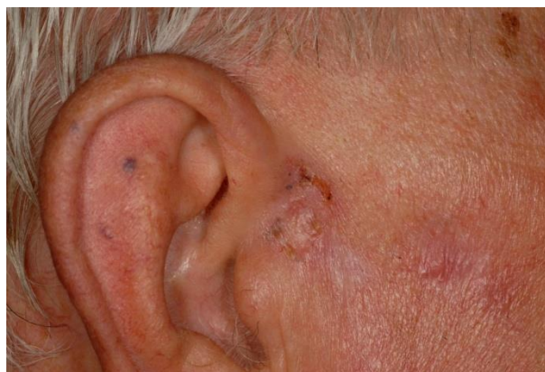
4 weeks after treatment