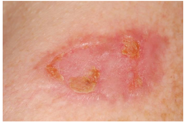
1 week after treatment