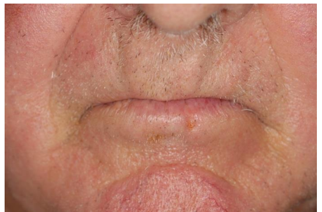
4 weeks after treatment